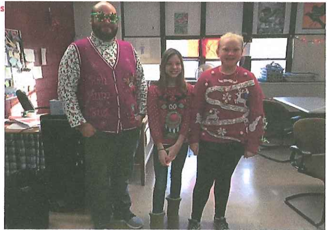
DLR staff and students compete for the ugliest Christmas sweaters worn to school.