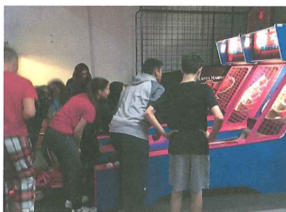
8 th grade students and staff enjoy their PBIS reward day at Plum Hollow in Dixon.

Respectfully submitted... Educators are lifelong learners who are productive, responsible citizens.