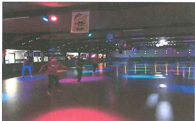
7 th grade students and staff enjoy Positive Behavioral Interventions & Supports (PBIS) reward day at Pines Skating.