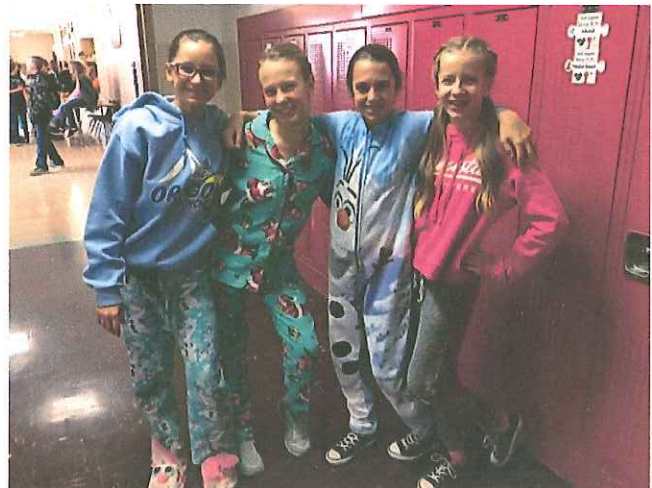
Pre-schoolers and seventh graders alike enjoy pajama day at DLR just before Christmas break.

Mission: Educate students to be lifelong learners who are productive, responsible citizens.