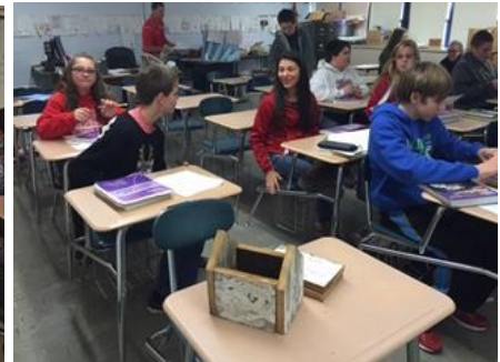
Students work out dimensions for birdhouses and work with a prototype prior to construction