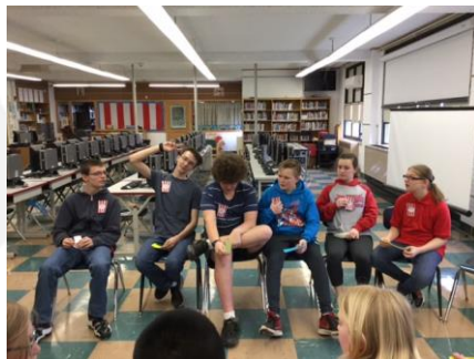
Winning team, the 8 th graders.