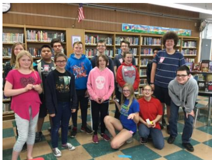
7 th & 8 th grade BOTB teams.

Battle of the Books (BOTB) this year was an epic battle!