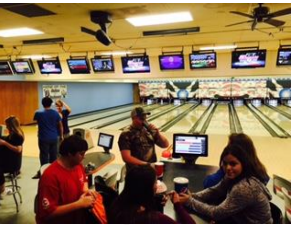
8<sup>th</sup> grade students spent December 21<sup>st</sup> at Plum Hollow in Dixon celebrating a positive end to 1<sup>st</sup> semester.

Mission: Educate students to be lifelong learners who are productive, responsible citizens.