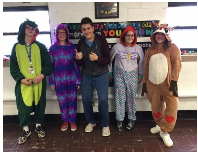
Students and staff alike enjoy dress up days the week prior to Christmas break.