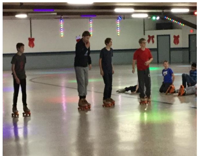
7 th graders and staff enjoy their SOAR reward trip to White Pines Skating on Friday, December 20 th . Students earned the trip by maintaining appropriate academic and behavioral standing.

Mission: Educate students to be lifelong learners who are productive, responsible citizens.