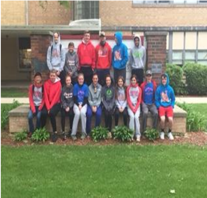
State track athletes departure for East Peoria!

DLR track competes at state meet in East Peoria.