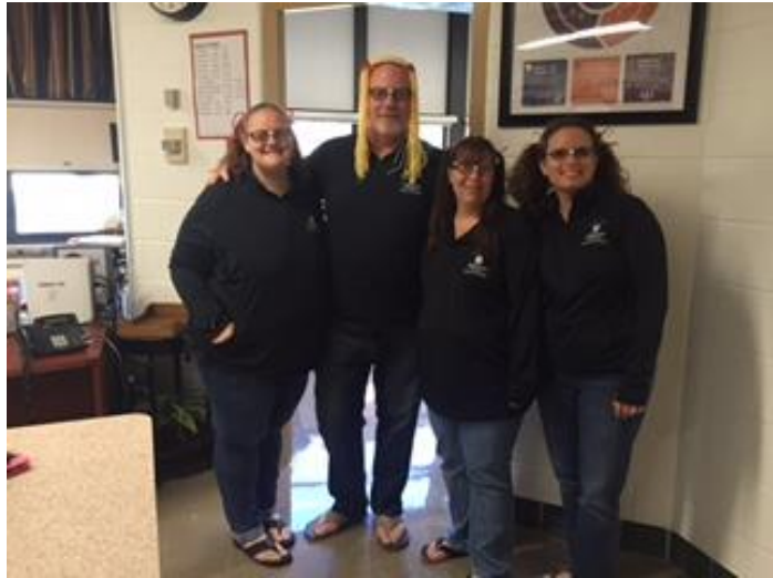
Here, a not so focused office staff celebrating Twin Day during Oregon's homecoming celebration week!