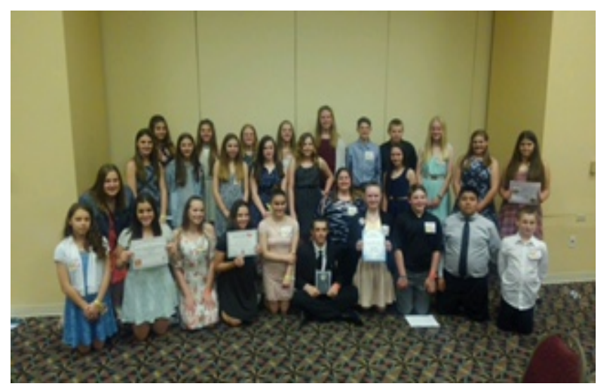
State honor council with individual awards in all 5 categories!