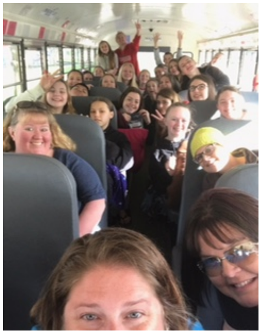
Exciting departure for Springfield!