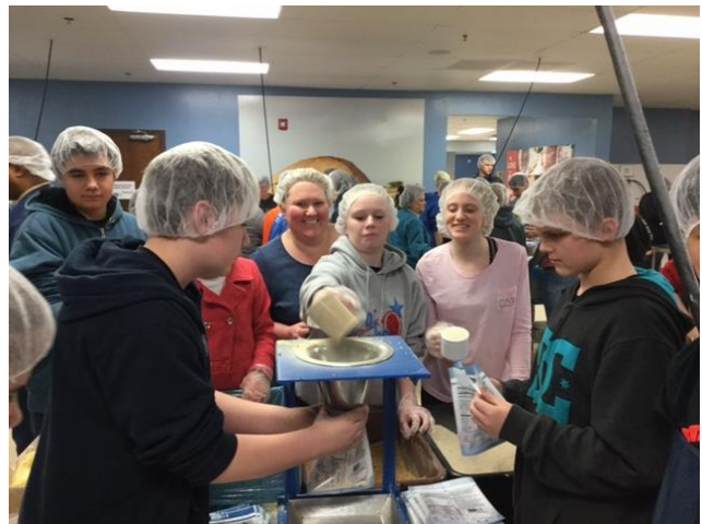
Students and staff serve at the Feed My Starving Children (FMSC) location in Aurora, IL