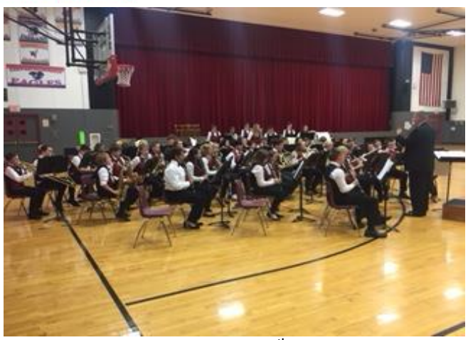
The DLR choir and band performed their spring concert on Thursday, May 9<sup>th</sup>. They both had outstanding performances. The crowd gave them a standing ovation when they performed a combined medley featuring songs from "Queen!